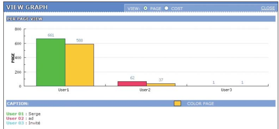
Pcounter Web Report

All print and document activity will be placed in a central log from which the customer can analyse and optimize the print and document output set-up, and hereby lowering the overall cost for document output.